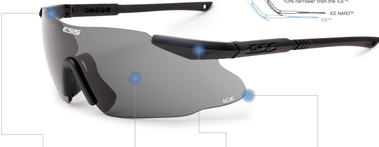
ICE NARO™ ICE™

“Frameless” Design Provides Unlimited Field of View